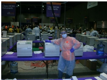
CDA Cares – Lead Sterilization and Infection Control