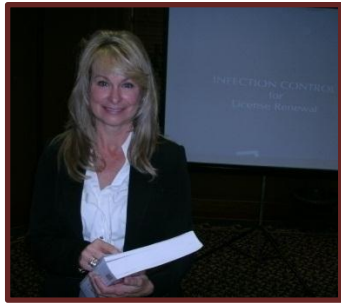
Teaching for Western Los Angeles DS

Templates for required In-Office protocols to coordinate In-Office Housekeeping, Sterilization, and Management of Injuries provided and reviewed.