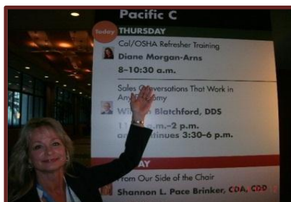
CDA San Francisco

Last but not least, Cal/OSHA requires every employer in the state of CA to implement and maintain an Injury and Illness Prevention Plan and provide Refresher Training on the plan at least annually or whenever changes occur. Basic components of IIPP and resources provided to facilitate In-Office safety programs – IIPP, and training specific to your office.