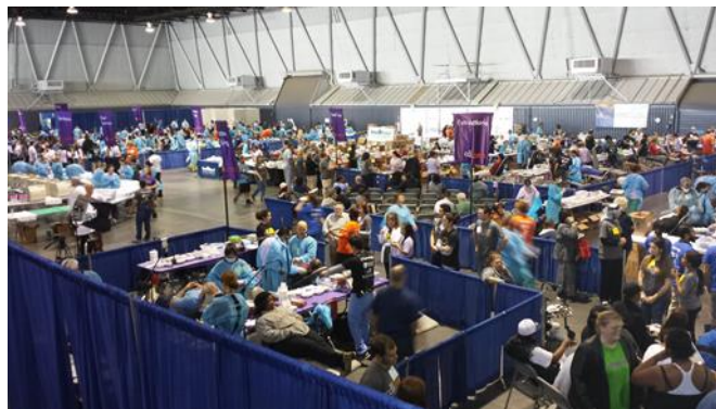
CDA Cares – Free Dental Clinic Sacramento