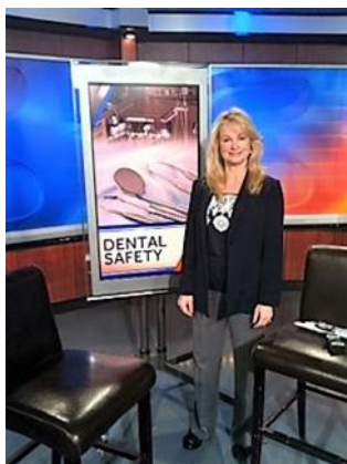
KCRA News – Dental Safety