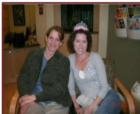
In-Office IIPP Training – New Safety Queen

Take this proactive approach for the health & safety of all DHCPs in your office, and finally have an IIPP that is an effective training and communication tool, to reduce or totally eliminate opportunities for disease transmission and/or workplace injuries.