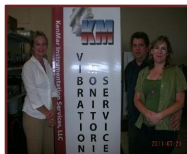
In-Office CAL/OSHA Training