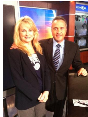
KCRA News – Infection Control