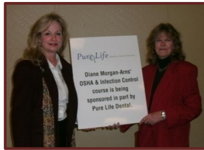
Tulare-Kings DS celebrates 100 years